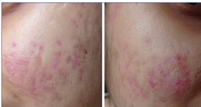
[Table/Fig-10]: 2 nd follow-up lesions after 45 days of treatment.

The early irregularities associated with acne are: