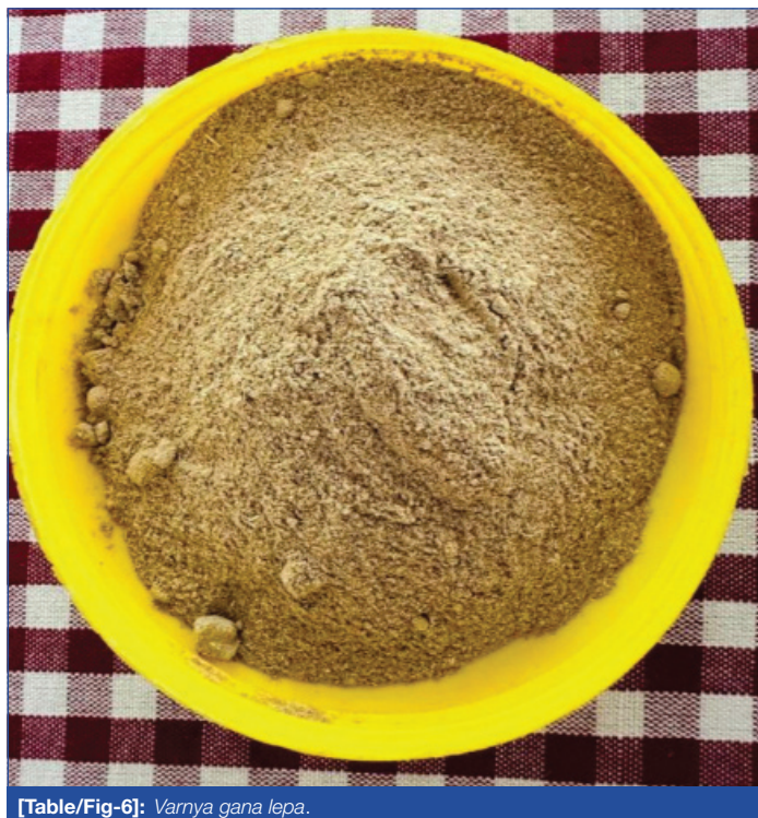
[Table/Fig-6]: Varnya gana lepa .

The gradation and score [1] are mentioned in [Table/Fig-7].