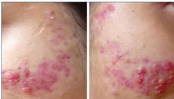
[Table/Fig-9]: 1 st follow-up lesions after 15 days of treatment.